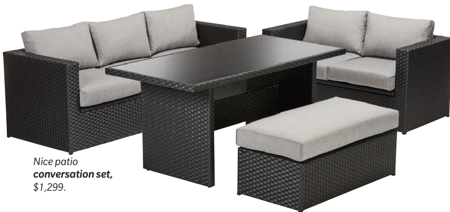
Nice patio conversation set, $1,299.