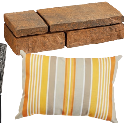
Striped decorative pillow, $12.99.