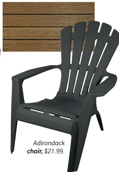
Adirondack chair, $21.99.