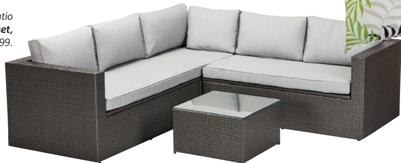
Verona patio sectional set, $1,199.

Backyard design by Myke Hodgins and Associates Landscape Architecture