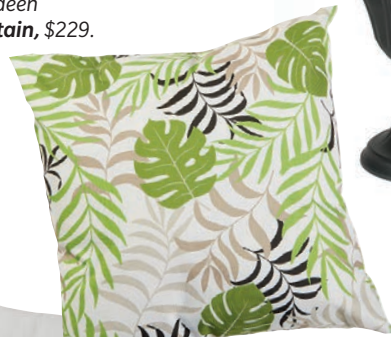
Decorative pillow, $14.99.