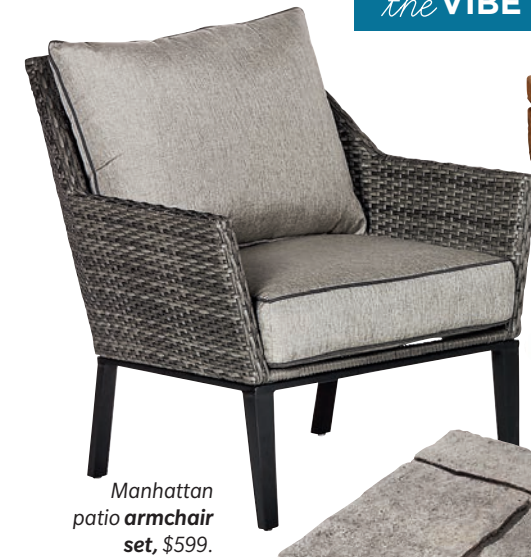
Manhattan patio armchair set, $599.