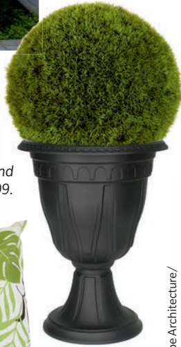
Azura urn, $11.99, and grass ball, $29.99.