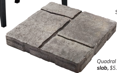
Quadral patio slab, $5.19 each.