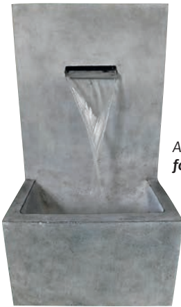
Aberdeen fountain, $229.

2. I love the mini city garden trend. When planned right, even a small space can accommodate a water feature, lounging areas, an outdoor kitchen and more.